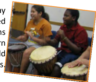
Kids learn to play hand-carved Djembe drums and learn 1,000-year-old dance steps.