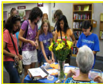
Friends also supported other programs such as "Make Your Own Mini Garden" and "Sew Your Own Ugly Doll," provided refreshments for several events including the "End of Summer" program which drew 68 young people.