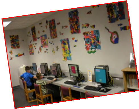
Part of the painting, drawing, glittering "Under the Sea" mural kids created in SCRL's Young Adult section under direction of Ray Hernandez.