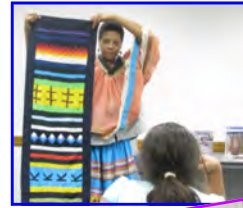
Fiber artist and Seminole descendant Che-Ke-Ka demonstrates the unique art of Seminole Paper Patchwork. Participants learn to tell their own stories in this medium.